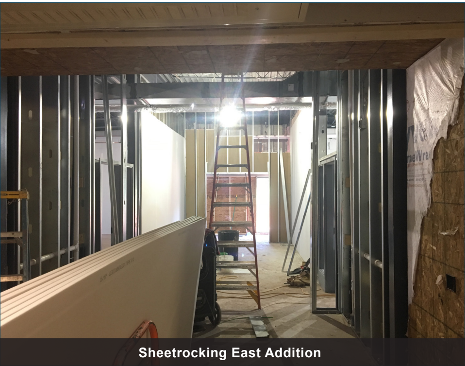
Sheetrocking East Addition