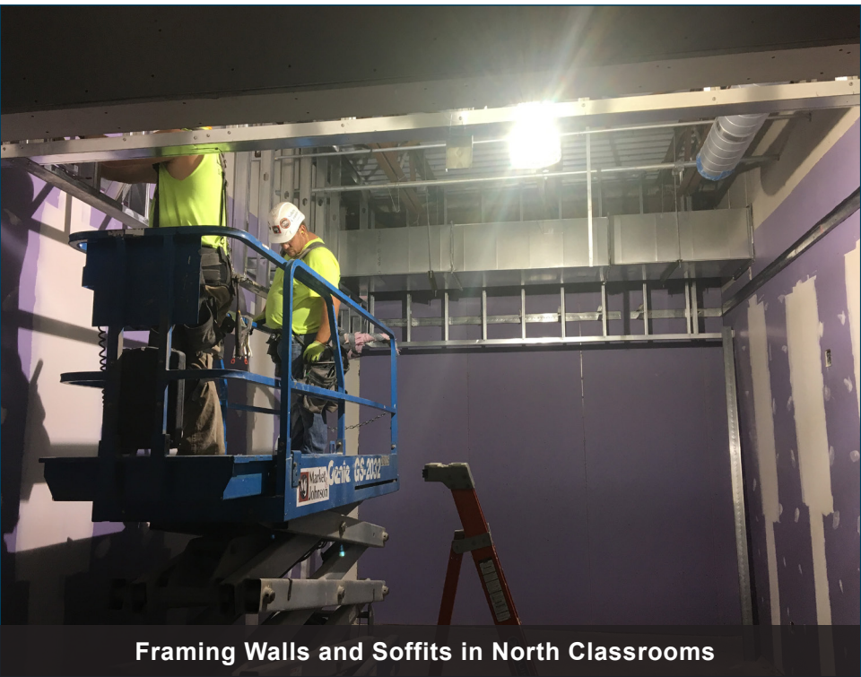
Framing Walls and Soffits in North Classrooms