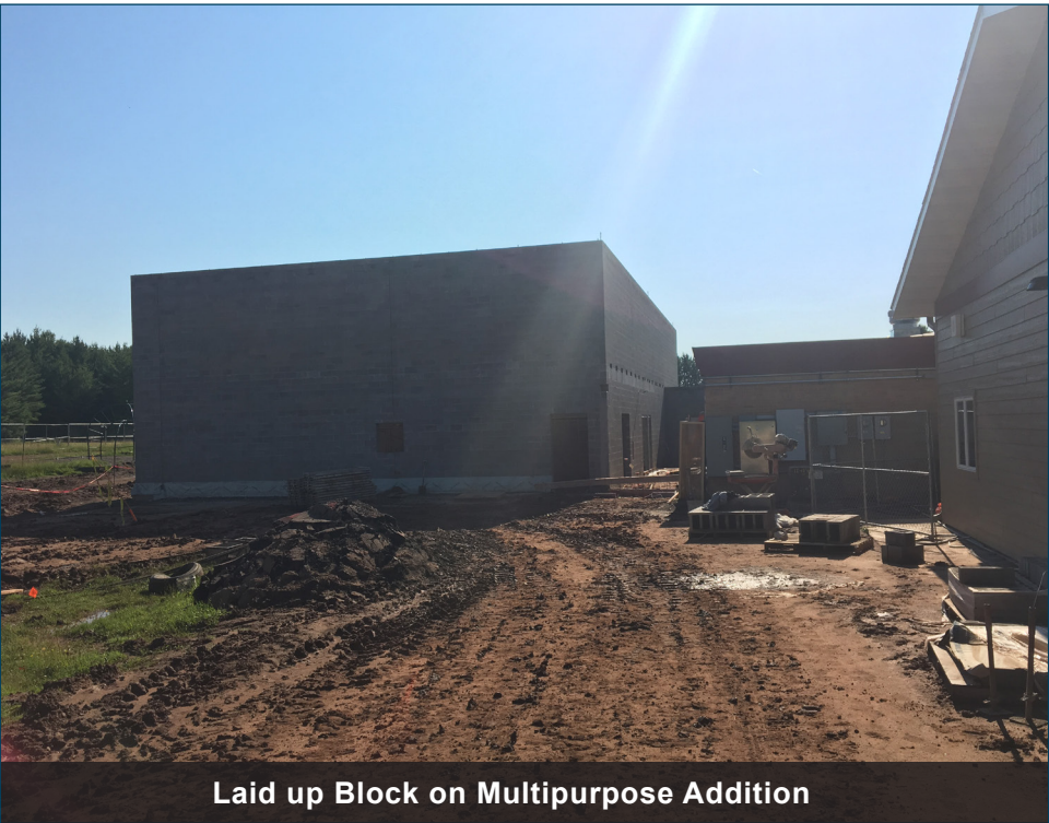
Laid up Block on Multipurpose Addition

Phase I and IA Complete..... August 15, 2017 Phase 2 Complete..... November 15, 2017