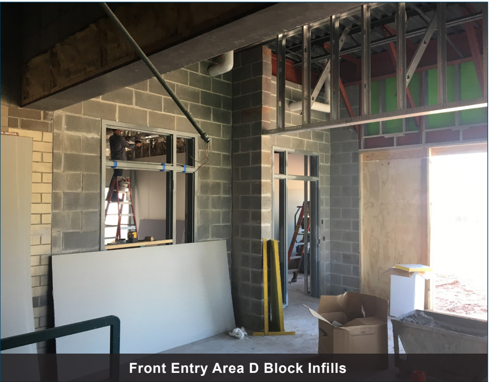
Front Entry Area D Block Infills

Phase I and IA Complete..... August 15, 2017 Phase II Complete..... November 15, 2017