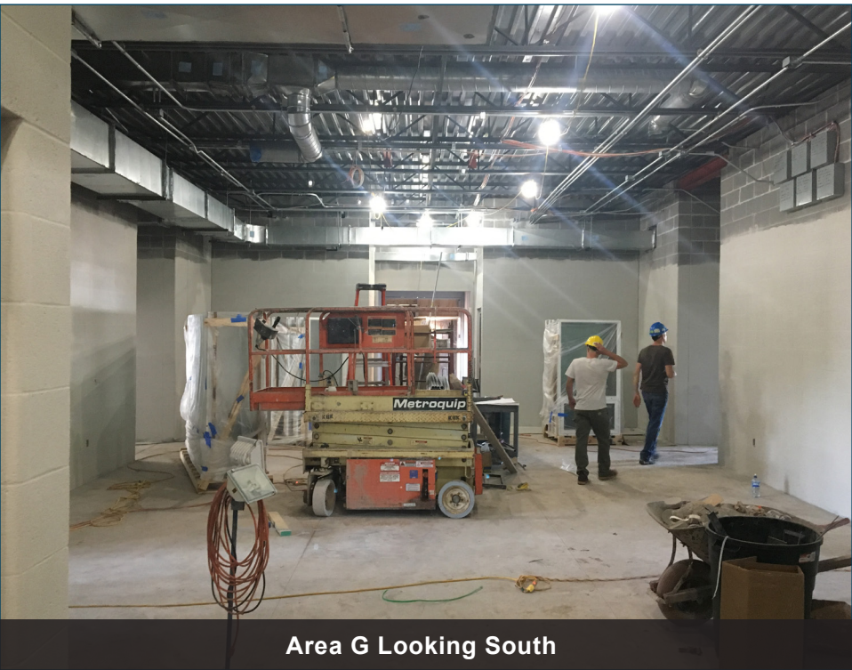
Area G Looking South