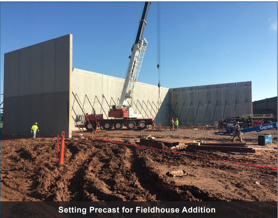
Setting Precast for Fieldhouse Addition