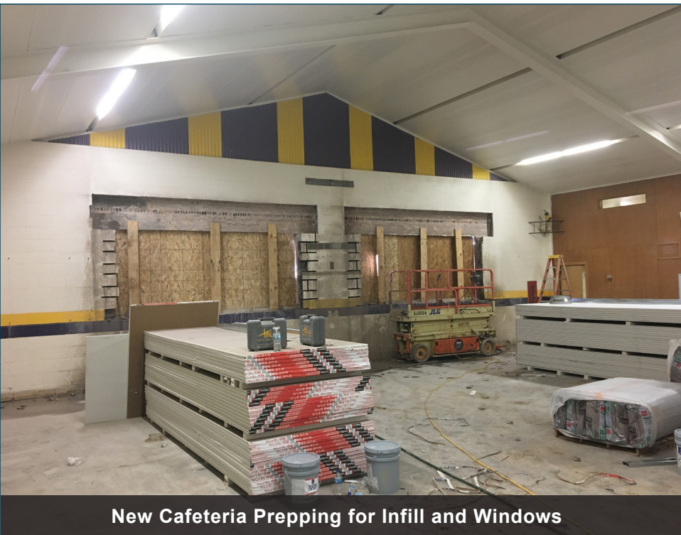
New Cafeteria Prepping for Infill and Windows