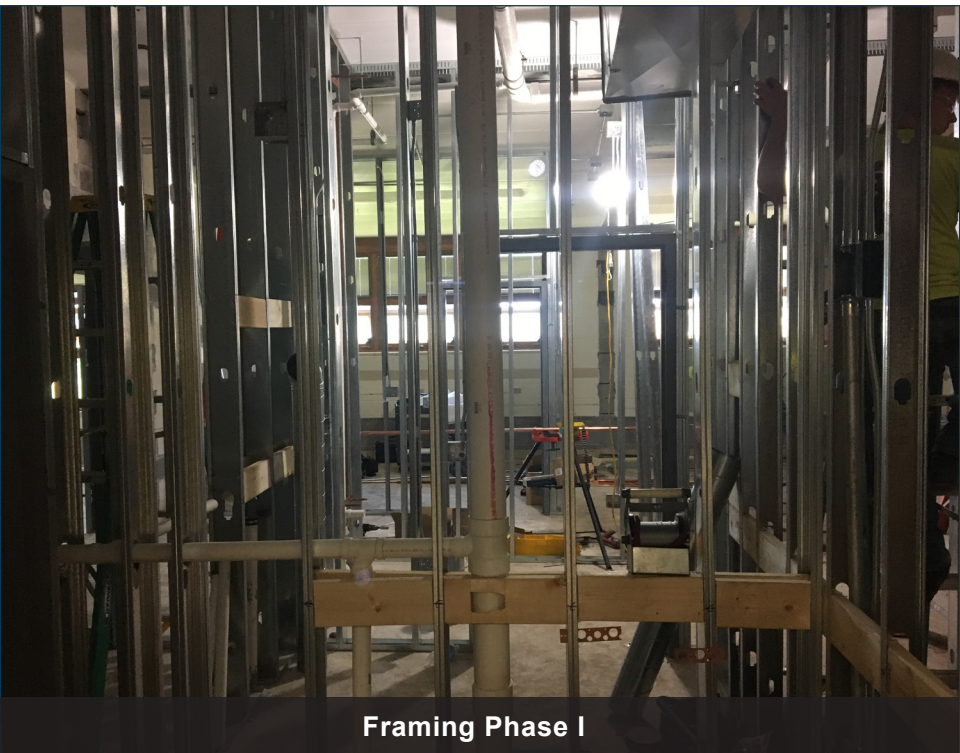
Framing Phase I