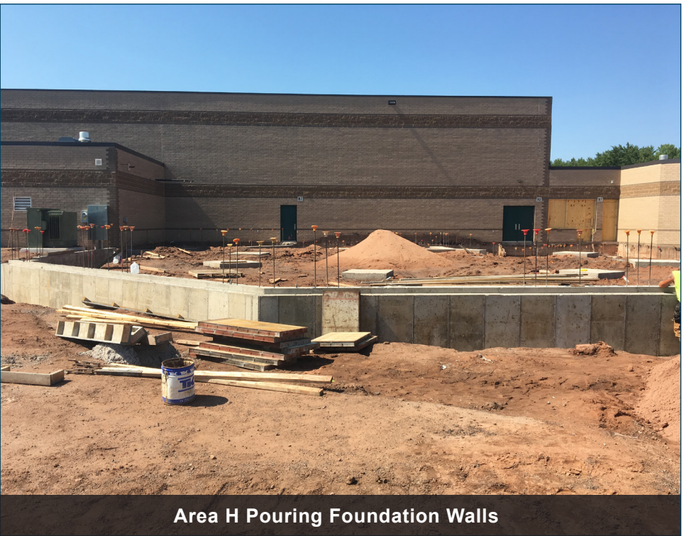
Area H Pouring Foundation Walls