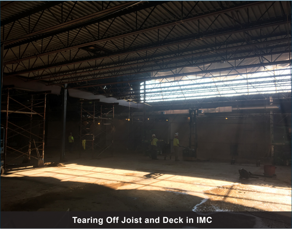
Tearing Off Joist and Deck in IMC